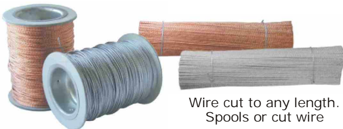
Wire cut to any length. Spools or cut wire

All type of twisted sealing wire available in cut lengths, spools, and coils. For use with Lead seals and Plastic Seals.